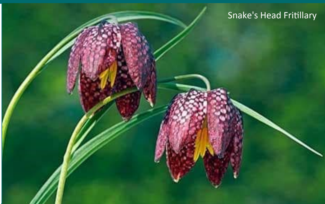
Snake's Head Fritillary

Work Experience Fidget Spinners Library News